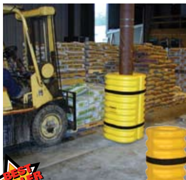
Narrow Column Protector