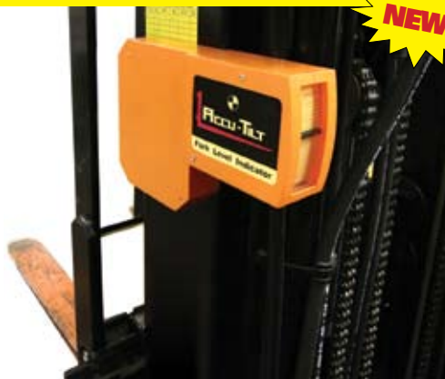
Easy to read display sits at eye level on the mast

The Accu-Tilt installs on any counterbalance lift truck in less than one minute without any tools. You will love the benefits of the Accu-Tilt.